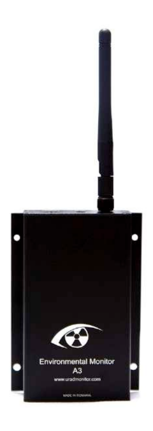
uRADMonitor A3 radio variant

Temperature, Relative Humidity, Volatile organic compounds (VOC), Formaldehyde, Ozone, Particulate matter PM1, PM2.5, PM10, Carbon Dioxide, Noise level.