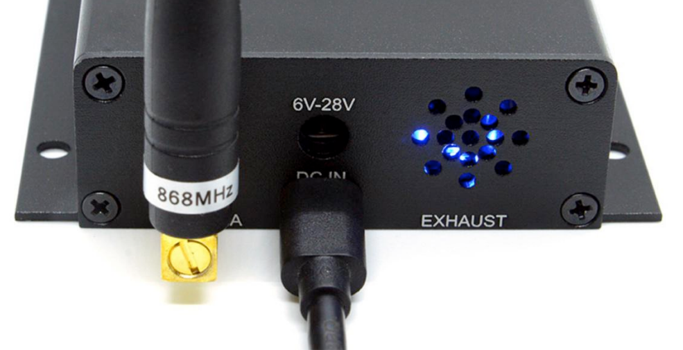
Figure 3. The USB port is marked with a white label and is located below the round power jack

Use a standard USB data cable to connect your computer to the uRADMonitor unit using its USB port.