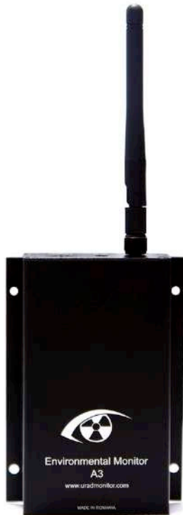
uRADMonitor A3 radio variant

Temperature, Relative Humidity, Volatile organic compounds (VOC), Formaldehyde, Ozone, Particulate matter PM1, PM2.5, PM10, Carbon Dioxide, Noise level.