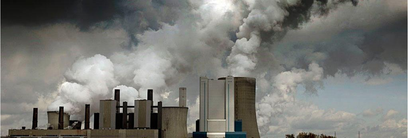
Picture: Air pollution can shorten our lifespan, this is why we need uRADMonitor

The purpose of the model D detector and that of the entire uRADMonitor network is to monitor chemical and physical factors that can have a negative impact on our health or on the environment. Using its advanced sensors, the model D monitors against the following potentially hazardous parameters: